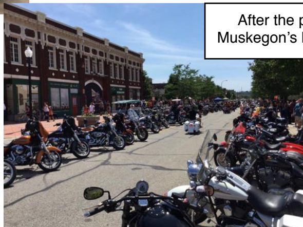
After the picnic, we drove to Muskegon's Bike Week Festivities