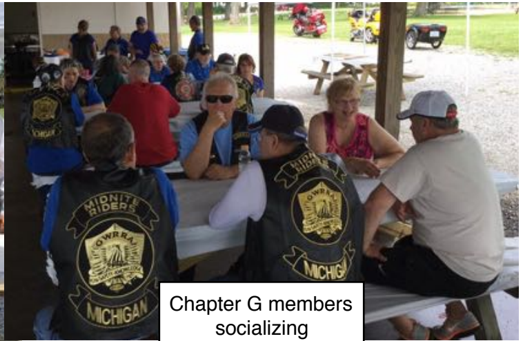
Chapter G members socializing