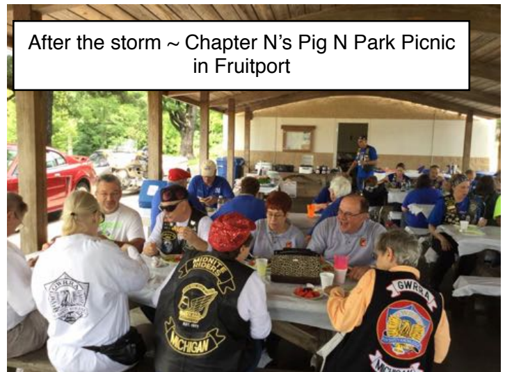
After the storm ~ Chapter N's Pig N Park Picnic in Fruitport