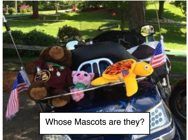
Whose Mascots are they?