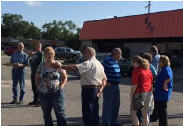
Chatting the parking lot before our ride to South Haven

July 19 we enjoyed breakfast at New Beginnings. A ride after to South Haven with lunch at the Thirsty Perch