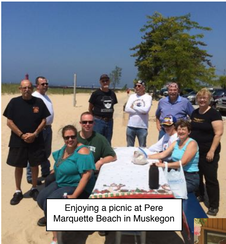
Enjoying a picnic at Pere Marquette Beach in Muskegon