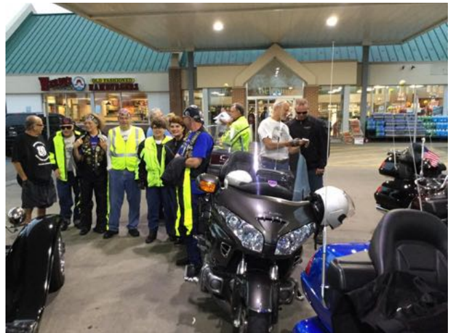
July 18 we planned to ride to Chapter N's Pig N Park Picnic in Fruitport. The day started out with dark skies and tornado warnings. Instead of riding into the storm, we sat and visited for an hour at Wendy's waiting for the storm to pass.