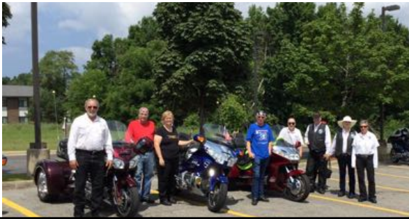
On July 12th after folding t-shirts at Bostic's house we decided a ride was needed to Holland for ice cream at Captain Sundae's!