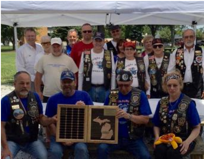
Chapter G members were presented with the Traveling Plaque. The chapter that comes the farthest and has the most members present is awarded this plaque. We then pass it on at the next gathering of ours that chapter members from other areas attend.